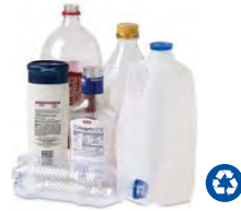
Plastic Bottles & Jugs

Please do not bag. Place these loose items in your recycling cart. Recyclables should be clean, dry & empty.