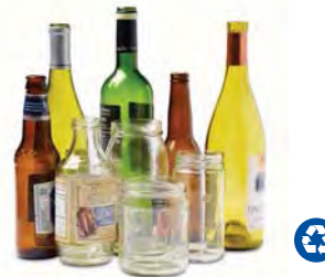
Glass Bottles & Containers

Everything you put in your recycling cart should be: