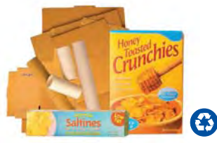
Flattened Cardboard & Paperboard