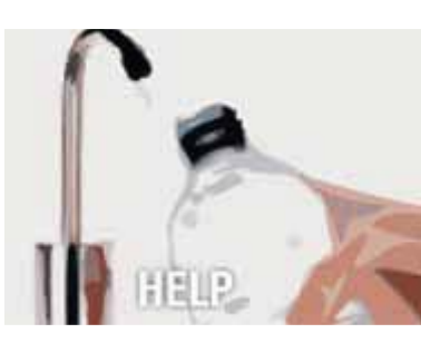
Find out more at GreshamOregon.gov/ Recycling or by visiting Tapltwater.com.