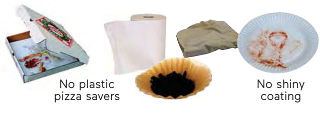
No plastic pizza savers