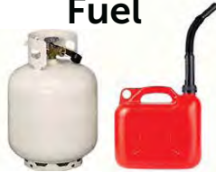
Gasoline, propane and butane tanks, kerosene