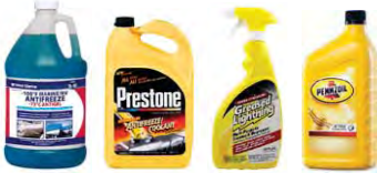
Motor oil, oil filters, antifreeze, auto fluids