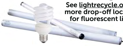
See lightrecycle.org for more drop-off locations for fluorescent lights