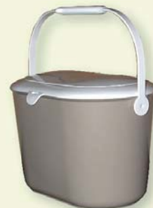
food scrap bucket