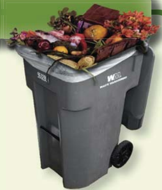
food scrap cart

For regular recycling, the City offers FREE personal recycling baskets to store and transport your recyclables to your outside carts or dumpsters. Each basket comes with information on what can and cannot be recycled. To receive FREE recycling baskets for your apartments or condominiums, ask your HOA or property manager to contact the City of Kirkland at (425) 587-3812 or by email at recycle@kirklandwa.gov .