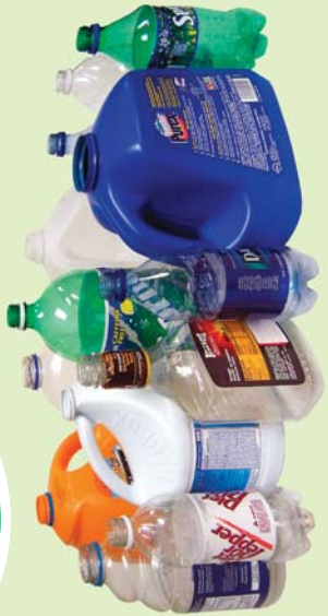
Plastic bottles (no caps)

Empty, clean containers Empty and discard plastic bags