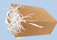
Shredded paper (OK in yard waste cart)