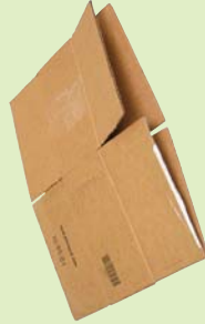
Cardboard—flattened (must fit in cart)