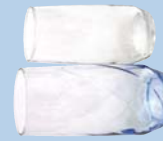
Glassware & plate glass