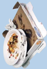
Food contaminated paper plates, napkins and pizza boxes