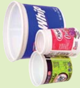
Plastic dairy tubs (no lids)