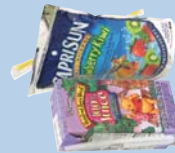
Juice boxes (foil lined)