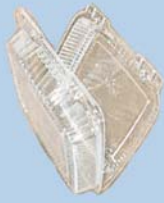
Clear clamshell containers