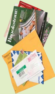
Mail, magazines, mixed paper and catalogs