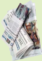
Newspaper & inserts