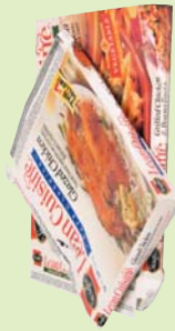
Paper or frozen food boxes (no food residue)