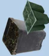
Plastic plant pots