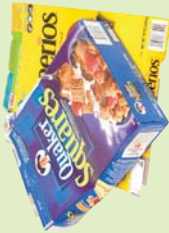
Paper boxes (no liners)