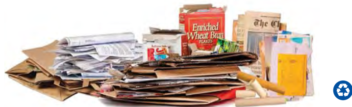
Paper, Flattened Cardboard & Paperboard