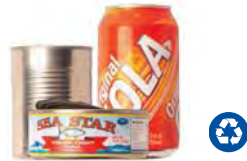
Food & Beverage Cans No loose lids