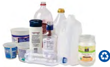
Plastic Bottles, Jugs, Jars & Dairy Tub No lids

All items must be clean, empty and placed loose in the recycle cart. Recycle only these items.