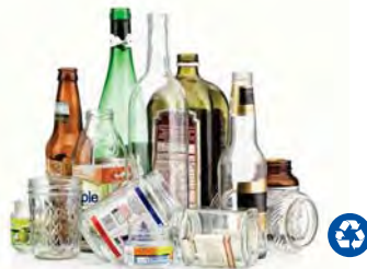
Glass Bottles & Jars No lids