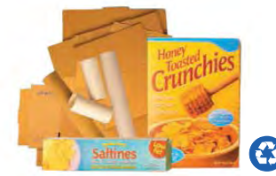
Flattened Cardboard & Paperboard