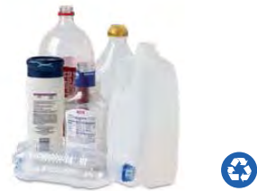
Plastic Bottles, Jugs

Recycling is an optional subscription service. Visit website for pricing.