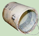
Empty Latex Paint Cans