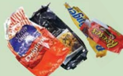
Snack & Coffee Bags