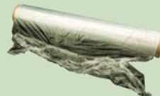
Kitchen Plastic Wrap