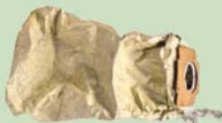
Vacuum Bags & Dust