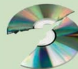
Broken Office Supplies