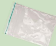
Plastic Ziptop Bags