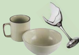
Ceramics, Plates & Broken Glass