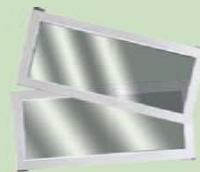
Window & Mirror Glass