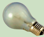
Old Style Light Bulbs