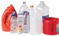
Plastic Bottles & Jugs

Please do not bag. Place these loose items in your recycling cart. Recyclables should be empty, clean and loose.