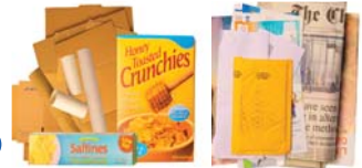
Paper, Flattened Cardboard & Paperboard