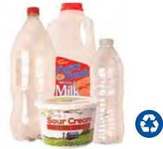
Plastic Bottles, Jugs and Tubs

All items must be clean, empty and placed loose in your recycle cart. Do not bag recycling.