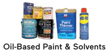
Oil-Based Paint & Solvents