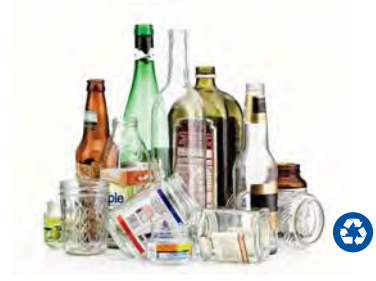
Glass Food & Beverage Containers