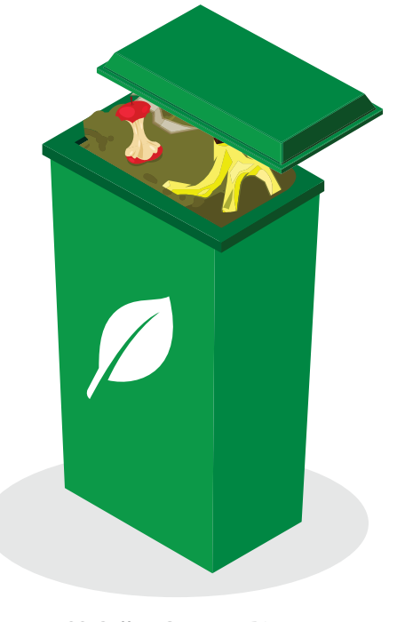
23 Gallon Compost Bin