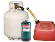
Fuel & Flammables