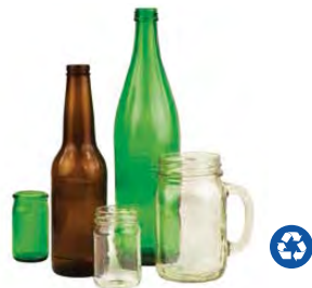
Glass Bottles & Containers

Recycling right is more important than ever.