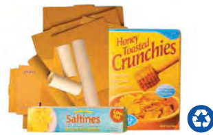
Flattened Cardboard & Paperboard