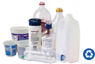
Plastic Bottles, Jugs & Tubs

Please do not bag. Place these loose items in your recycling cart.