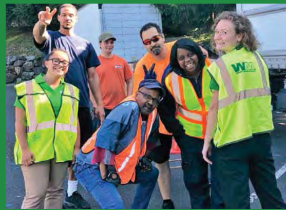
Think Green Reuse and Recycling events

NEW! Think Green Reuse and Recycling events. Convenient community events where residents can dispose of hard-to-recycle items safely and sustainably.