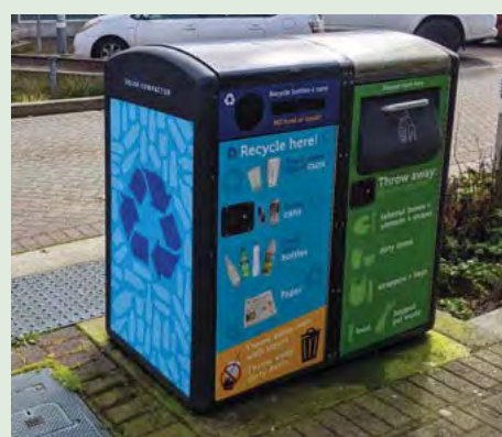
Bigbelly solar-powered compactors

NEW! Expanded WM customer service hours: Weekdays, 7 am - 7 pm Saturdays, 8 am - 5 pm