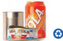
Food & Beverage Cans No loose lids