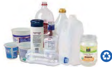
Plastic Bottles, Jugs, Jars & Dairy Tub No lids

All items must be clean, empty and placed loose in the recycle cart. Recycle only these items.