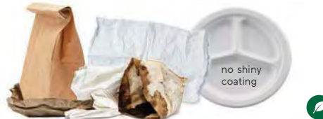
Food-Soiled Paper no shiny coating