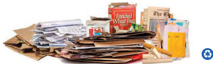
Paper, Flattened Cardboard & Paperboard