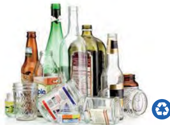
Glass Bottles & Jars No lids