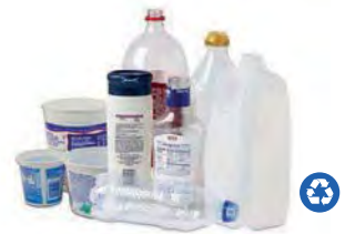
Plastic Bottles, Jugs & Tubs

Empty, rinse and place these loose items in your recycling cart. Only recycle the items listed.