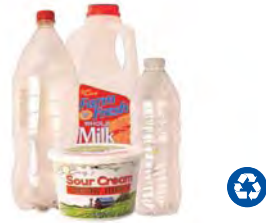
Plastic Bottles, Jugs and Tubs