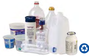
Plastic Bottles, Jugs & Tubs

Please do not bag. Place these items loose in your recycling cart. Recyclables should be empty, clean & loose.