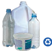
Plastic Bottles, Jugs & Tubs

Empty and rinse out all food residue. Empty materials loose into the cart. Only recycle the items listed.