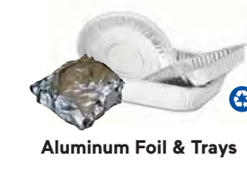
Aluminum Foil & Trays