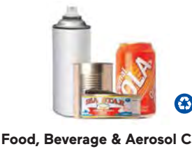
Food, Beverage & Aerosol Cans