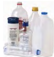
Plastic Bottles & Jugs

Please do not bag. Place these loose items in your recycling cart. Recyclables should be clean, dry & empty.