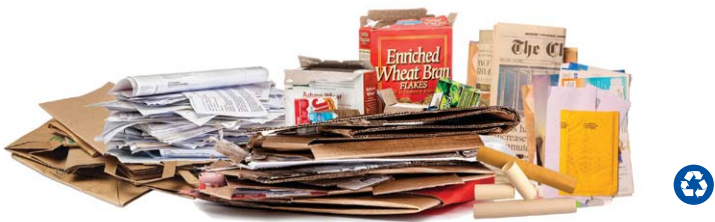
Paper, Flattened Cardboard & Paperboard