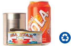
Food & Beverage Cans No loose lids