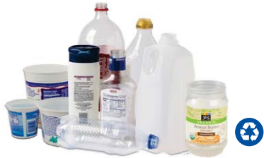
Plastic Bottles, Jugs, Jars & Dairy Tub No lids

All items must be clean, empty and placed loose in the recycle cart. Recycle only these items.