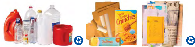
Plastic Bottles & Jugs

Please do not bag. Place these loose items in your recycling cart. Recyclables should be empty, clean and loose.