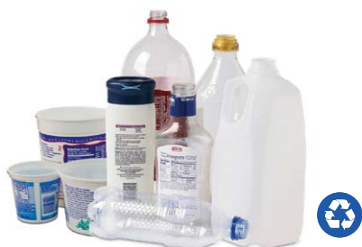
Plastic Bottles, Jugs & Tubs

Please do not bag. Place these loose items in your recycling cart.