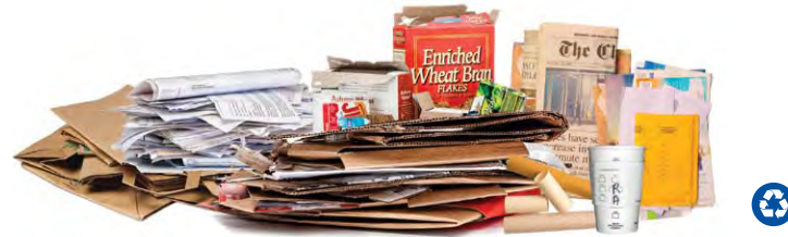
Paper, Flattened Cardboard & Paperboard