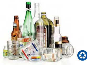
Glass Food & Beverage Containers no lids