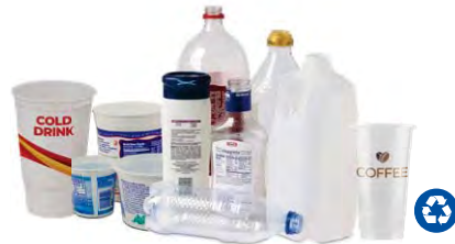
Plastic Bottles, Cups, Jugs & Tubs no colored party cups

All items must be clean, empty and loose. Please remove lids. Recycle only these items.