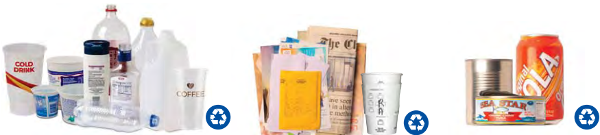
Plastic Bottles, Cups, Jugs & Tubs (No colored party cups)

Empty, rinse and place these loose items in your recycling cart. Only recycle the items listed.