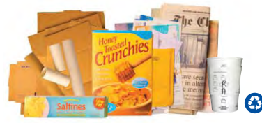
Flattened Cardboard, Paperboard & Paper