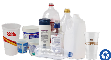
Plastic Bottles, Cups, Jugs & Tubs (No colored party cups)

Please do not bag. Place these loose items in your recycling cart.