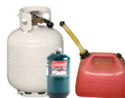
Fuel & Flammables