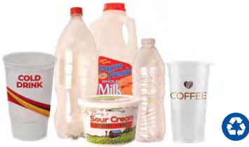
Plastic Bottles, Cups, Jugs & Tubs (No colored party cups)

All items must be clean, empty and placed loose in your recycle cart. Do not bag recycling.