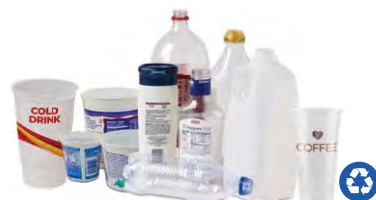
Plastic Bottles, Cups, Jugs & Tubs

Do not bag. Place these loose items in your recycling cart.