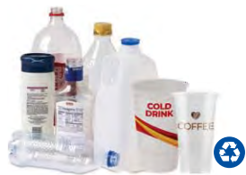
Plastic Bottles, Cups & Jugs

Please do not bag. Place these items loose in your recycling cart. Recyclables should be clean, dry & empty.