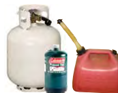
Fuel & Flammables