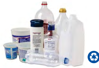
Plastic Bottles, Jugs & Tubs

Please do not bag. Place these loose items in your recycling cart.