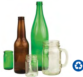
Glass Bottles & Containers

Recycling right is more important than ever.