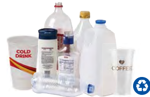
Plastic Bottles, Cups & Jugs (No colored party cups)

Please do not bag. Place these loose items in your recycling cart. Recyclables should be clean, dry & empty.