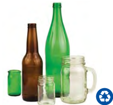
Glass Bottles & Food Containers