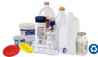
Plastic Bottles, Jugs, Tubs & Lids over 3"

Please do not bag. Place these loose items in your recycling cart. Recyclables should be empty, clean & loose .