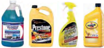
Motor oil, oil filters, antifreeze, auto fluids