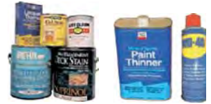
Oil-based paint, paint thinner, stains, polish, varnish, solvents, spray paint