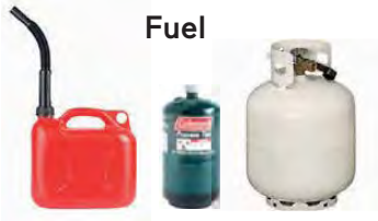
Gasoline, propane and butane tanks, kerosene